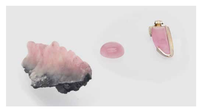
\bigtriangleup Figure 1: Pink cobaltocalcite from the Valais in Switzerland as stalactites on the graphite-rich host rock and as cut and polished specimens investigated for this study.

Switzerland is not known for gem deposits, although we have some small outcrops and findings even of ruby and emerald in metamorphosed rocks in the Swiss Alps. Well-known however are Alpine-type hydrothermal mineral formations, e.g. the 'classic' rock crystals with pink fluorite and many other and partly very rare and unique minerals for mineral collectors. All of these minerals formed during the main geological activity of the Alpine orogeny in the late Tertiary about 35-10 million years ago as a result of the collision of the African plate with the Eurasian continent.