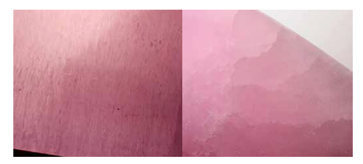
\bigtriangleup\, Figures 2 (left) and 3 (right) revealing the dense fibrous to mosaic texture of the investigated cobaltocalcite.

Chemical and structural (Raman spectroscopy) analyses immediately revealed that this material is cobaltocalcite (Ca,Co)CO<sub>3</sub>, a pink to purple variety of calcite, well-known and appreciated by mineral and gem collectors due to its attractive colour. Cobaltocalcite - mostly found as polycrystalline aggregates – is especially known as a by-product from several ore mines in Africa (e.g. Democratic Republic of Congo) and further mines in Spain, Italy (Elba), and Germany, to name a few.